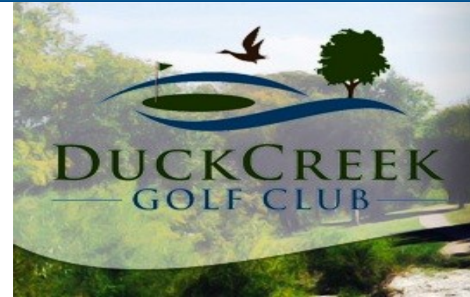
2016 Venue—Duck Creek Golf Club