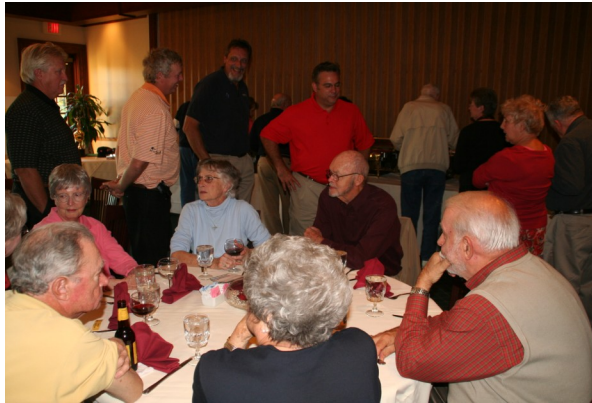
Parish wide Veterans Day Dinner Bring your whole family

This year the Drake Golf Challenge falls near Veterans Day. So we plan to have a church wide Veterans Day Celebration Dinner in Founder's Hall. We will celebrate a dinner created by members of the Epiphany Brotherhood Chapter and Men's Club .All Epiphanyites are invited. The event will be held at 6:00 p.m. Contributions for this event begin at $10 per person. Included are the festivities, dinner and a glass of wine or beer plus the Christian fellowship for which Epiphany is Known. All net proceeds (golf and dinner) will go directly to the Mike McAuley and John Cook Memorial Fund supporting the St. Simon's After School Program. This is a worthy program providing in-school care for K through 5 children who would otherwise be alone after school. District teachers and St. Simon's volunteers give the kids additional learning opportunity, snacks and games.